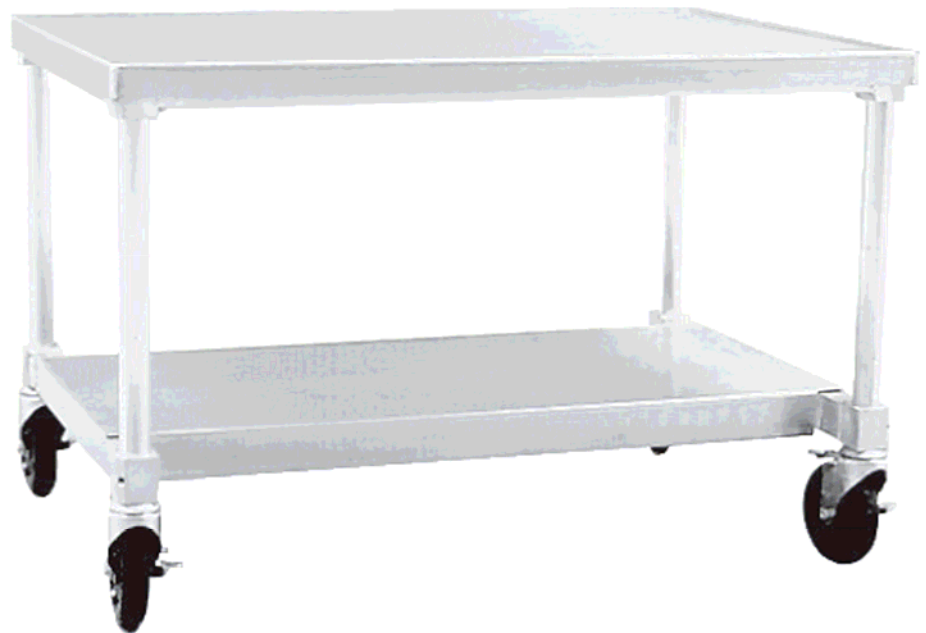
EQUIPMENT STAND SHOWN WITH OPTIONAL UNDERSHELF AND CASTERS

This all purpose stand is perfect for counter-top cooking as well as holding or serving equipment. Removable heavy-duty 12-gauge aluminum top and optional under shelf lift off for easy cleaning and are fully supported by the all welded, heavy-duty frame. Marine edge provides easy cleaning and equipment stability. Adjustable posts allow for quick stabilization and easy leveling on stationary units while 5" stem type casters provide smooth transportation for mobile units.