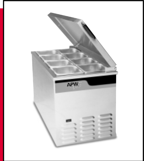
Countertop Cold Well