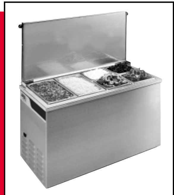
Countertop Cold Well

See reverse side for product specifications.