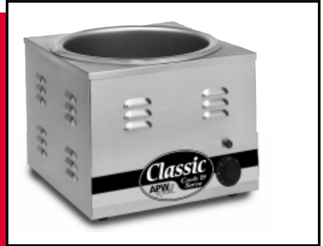
MODEL CW-1B CLASSIC COOK & SERVE