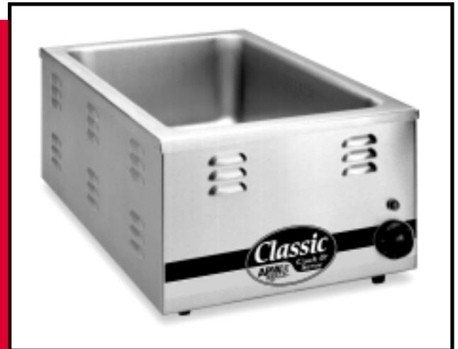
MODEL CW-2A CLASSIC COOK & SERVE