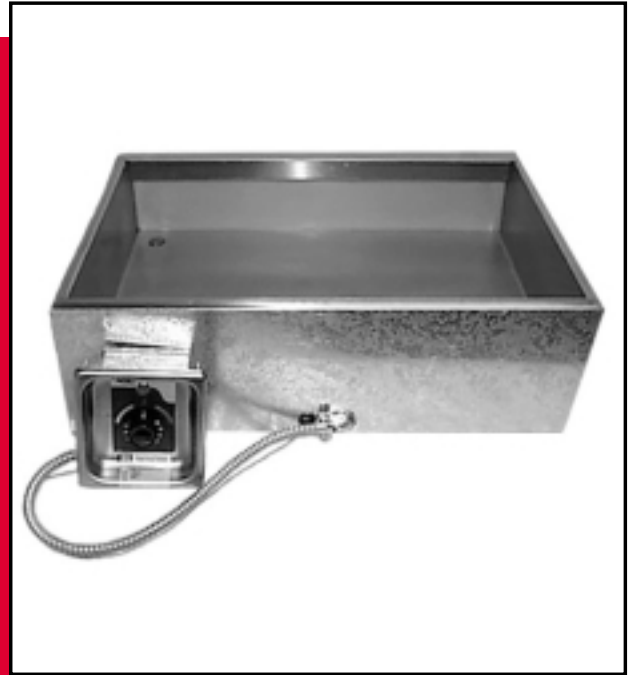
Bottom Mount Hot Food Well, Top View

Heavy-duty bottom mount, Insulated Rectangular Hot Food Well is designed for installation in metal countertop. Single insulated heavy gauge galvanized steel wrapper. Hot Food Well accommodates standard size steamtable pans. Holds (2) 12x20 full size pans (6" deep) and also accommodates (1) full sized (18" x 26") bun pan. The units feature complete UL listed construction including electrical conduit, bezel and control box. All required adapters included. Well is constructed of deep-drawn, 20 ga., Type 304, stainless steel. Units shipped with drain are provided with stainless steel 1/2 NPT drain welded to bottom of pan and provided with removable screen. Unit is heated by tubular calrod heat element shaped in serpentine fashion for even heat distribution to pan base. Element mounted under well and secured by aluminized deflector shield for maximum efficiency. Entire heat assembly covered with inspection housing with layer of 1 1/2" thick compressed fiberglass insulation fixed to bottom of pan with threaded studs for easy service.