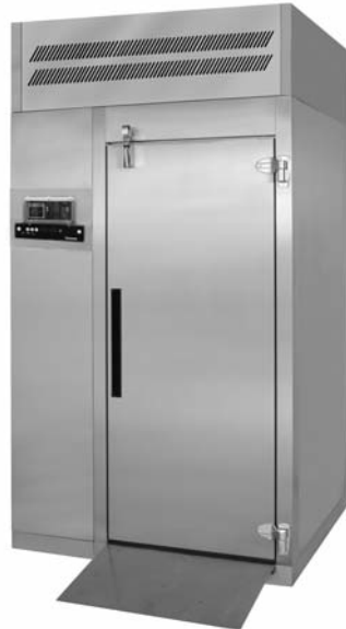
Model shown with optional insulated floor and ramp.